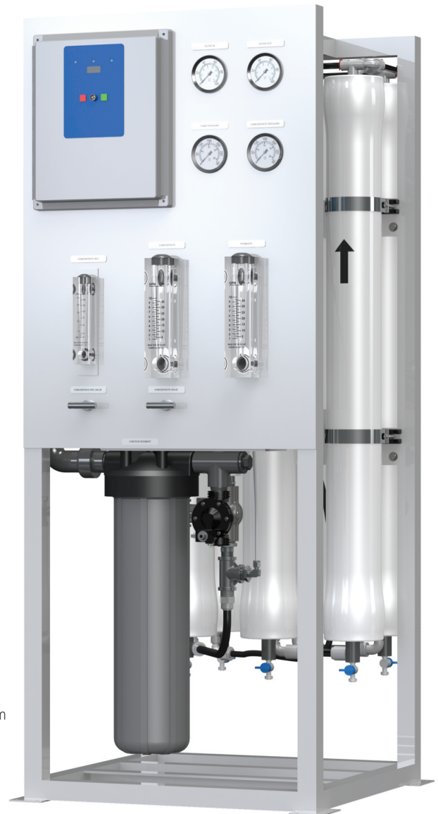
R1 – 6140 Reverse Osmosis System

R1 – Series Reverse Osmosis Systems have been engineered for capacities ranging from 1,500 – 21,600 gallons per day.